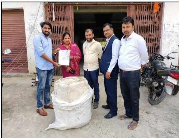
Photo: 1 Medical Tent Handover Samsi