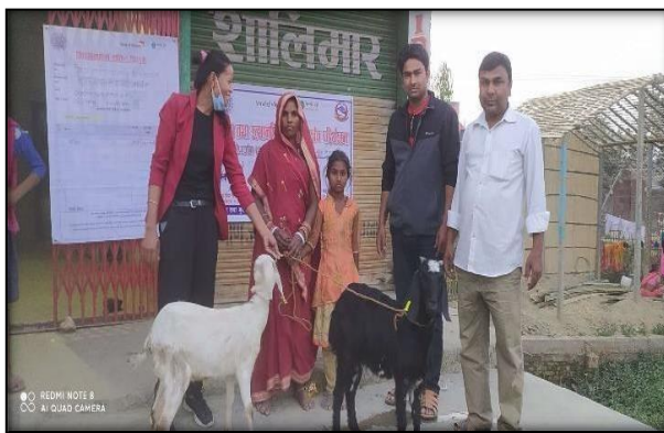
Photo: 10 Goat Support to UPG HH at Ekdara ward no.5