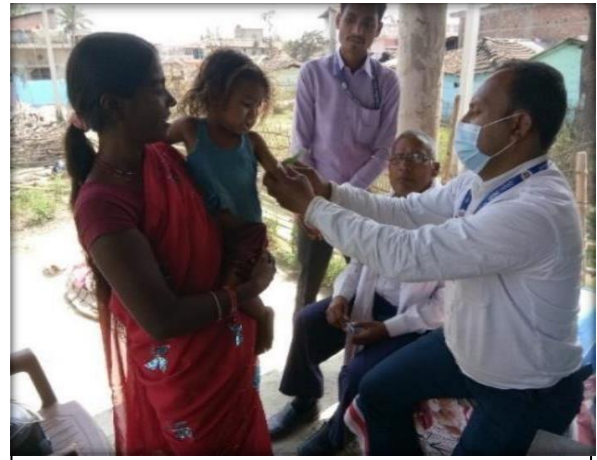
Photo: 6 Growth Monitoring Promotion Event at Ekdara