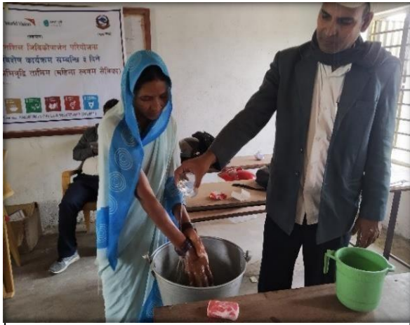
Photo: 5 Demonstration of Hand washing technique with soap and water