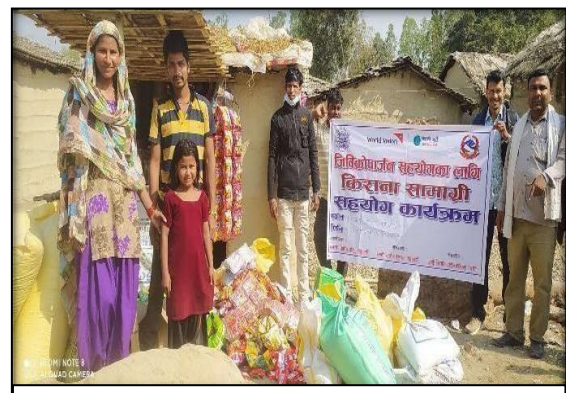
Photo: 11 Business Recovery Support to MVC RC family under Business recovery