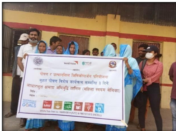
Photo: 3 CNSI-FCHV Level Training at Samsi